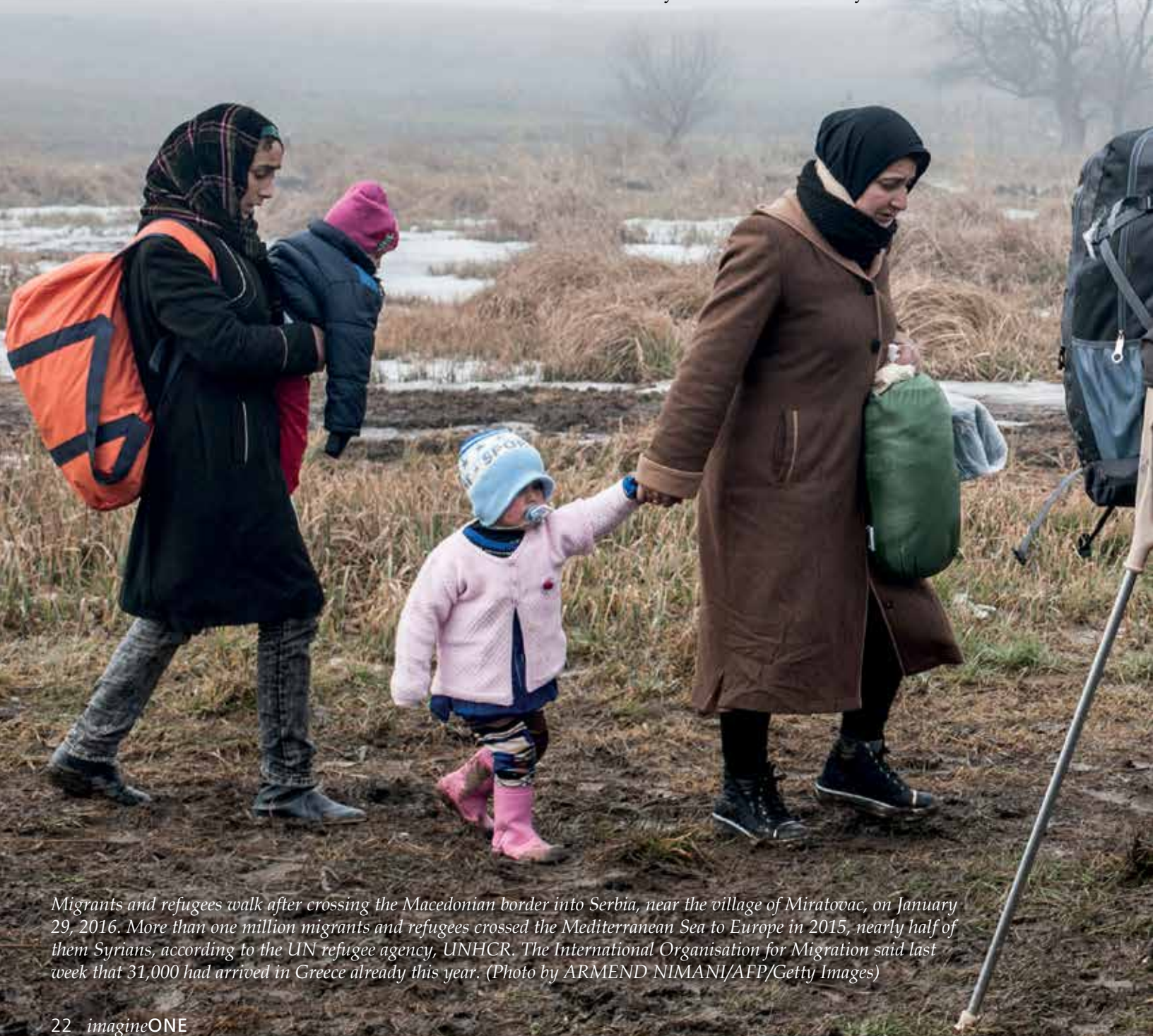
Migrants and refugees walk after crossing the Macedonian border into Serbia, near the village of Miratovac, on January 29, 2016. More than one million migrants and refugees crossed the Mediterranean Sea to Europe in 2015, nearly half of them Syrians, according to the UN refugee agency, UNHCR. The International Organisation for Migration said last week that 31,000 had arrived in Greece already this year.

There are a couple of important points to emphasize here: 1) The refugees are desperately fleeing the same enemy we Americans fear; and 2) Those who help the refugees have a tremendous opportunity to bond in solidarity with them, and they with us.