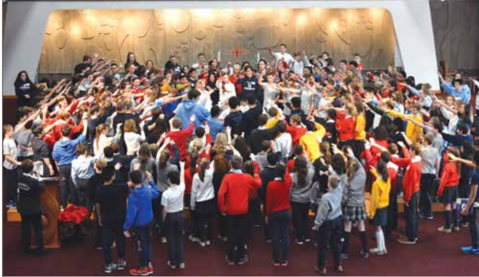
7th grade students from several local Chicago area schools gathered in the Chapel of our LaGrange Park center for a youth retreat hosted by CSJ sponsored Nazareth Academy. Here, they are blessing personal hygiene items they collected which will be donated to charity.