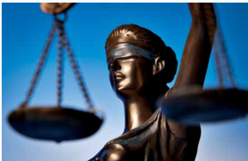
Blind Justice? The image of the Goddess of Justice balancing the scales and blindfolded goes back to ancient Rome.

My work with juvenile expungement is driven by my understanding that we are to “act justly and to love mercy.” I am a lawyer, but the law without mercy doesn’t do justice to the life, death, and message of Jesus Christ. In the context of my Catholic faith, expunging criminal records is a just act of redemption. It is a second chance for people who were never given a first chance, who were presumed guilty even as children and teenagers.