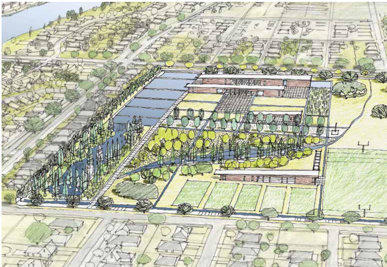
Artist's rendering of completed Mirabeau Water Garden.

We are thrilled to tell imagineONE readers that the New Orleans City Council and Mayor Mitch Landrieu have approved plans for transforming our now vacant 25-acre property there into a beautiful multi-purpose garden park and storm water management system.