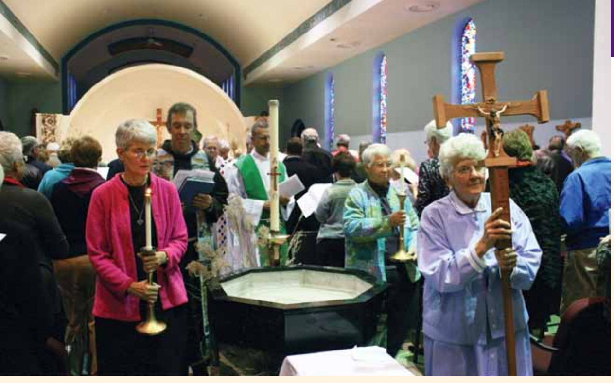
Sisters, clergy and friends exit a special last Mass together celebrating all that the Sisters of St. Joseph have meant to people in the Tipton area since 1888.