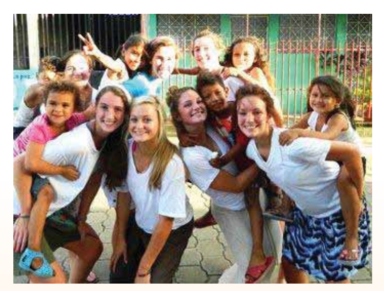
A mission trip to Nicaragua impressed students with firsthand awareness of children living in extreme poverty.

Shrine Catholic High School (Royal Oaks, Mich.) "Mission to Nicaragua" supports high school students who are future leaders to experience another culture first-hand and gain a global vision to appreciate inclusiveness and diversity.