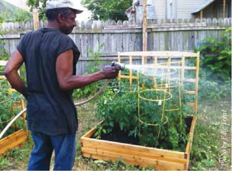
One of the residents tends to a garden outside the Houston Place Apartments, in Kalamazoo, Mich., where young families, single adults and seniors share management responsibilities.

Friends of Batahola (Managua, Nicaragua) "Providing Empowerment, Gender Equality, Violence Prevention Project" teaches adult and adolescent women and men from poor neighborhoods ways to increase their access to and control over economic resources. This helps them develop self-esteem, leadership and analysis and communication skills to defend their rights and to challenge harmful social norms. It also teaches them to coordinate with networks and government institutions to establish new alliances for women's empowerment and violence prevention. (See article in this issue on page 18.)