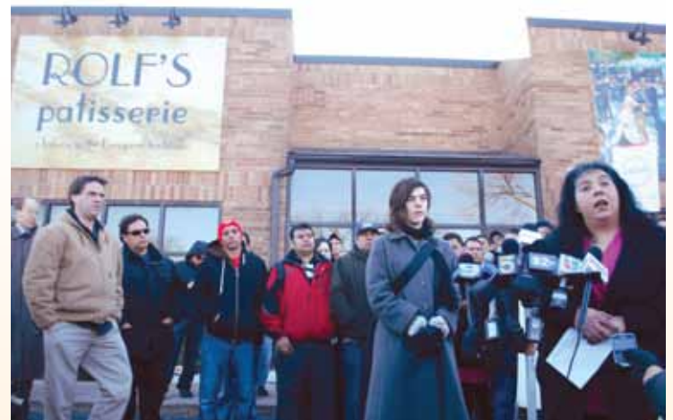
Arise Chicago, a recipient of a grant from our Congregation, educates and assists low-wage workers in recovering owed wages and compensation. Above, former employees of Rolf's Patisserie in Chicago speak at a press conference about losing their jobs without warning and how their final paychecks bounced.

The church teaches the need to respect employees and their rights to a just wage, decent work, safe working conditions, disability protection, and security in retirement. People have priority over capital; people are more important than profit. It was this issue that led Pope Leo XIII to write his encyclical letter, "Rerum Novarum" (on capital and labor), during the industrial revolution when many factory workers were mistreated and abused in the workplace.