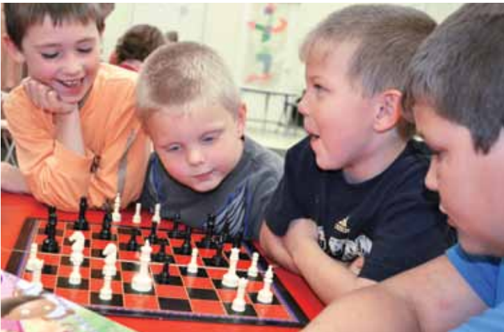
ABLE Families afterschool program offers a safe, fun and educational environment for children to grow and discover.

The church teaches that family and communities rooted in faith are the foundation of both church and society, living and teaching the values of the Gospel. Every government has responsibility for protecting, supporting, and encouraging the family for the basic well-being of the entire society.