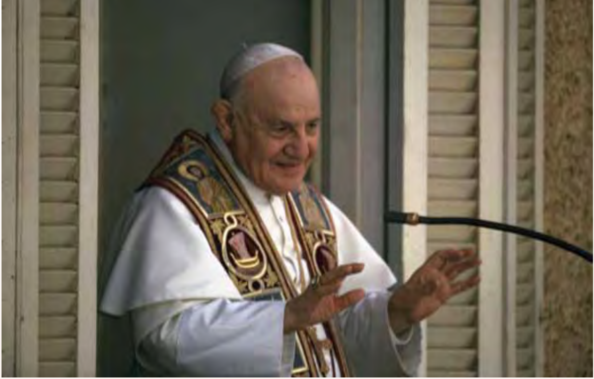
Pope John XXIII