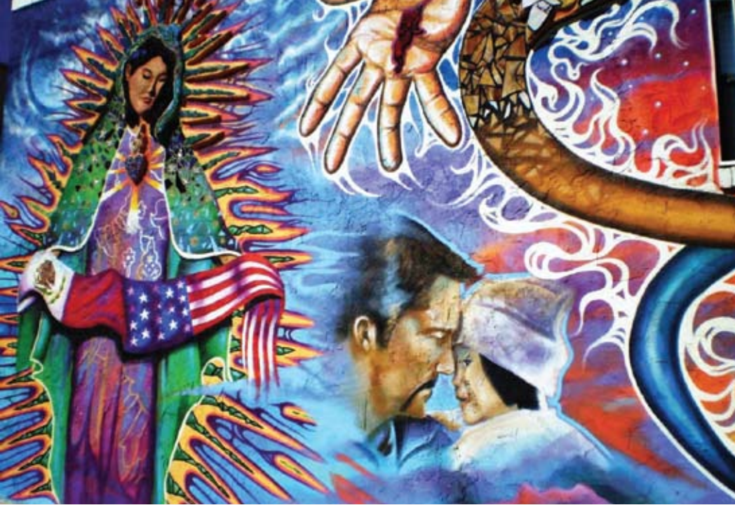
This mural in the older part of El Paso, Texas, depicts persons, events, history and scenes from the poor area around Sacred Heart Parish. The figures of the crucified Christ and Our Lady of Guadalupe are strong symbols of faith and hope for the suffering immigrant community.