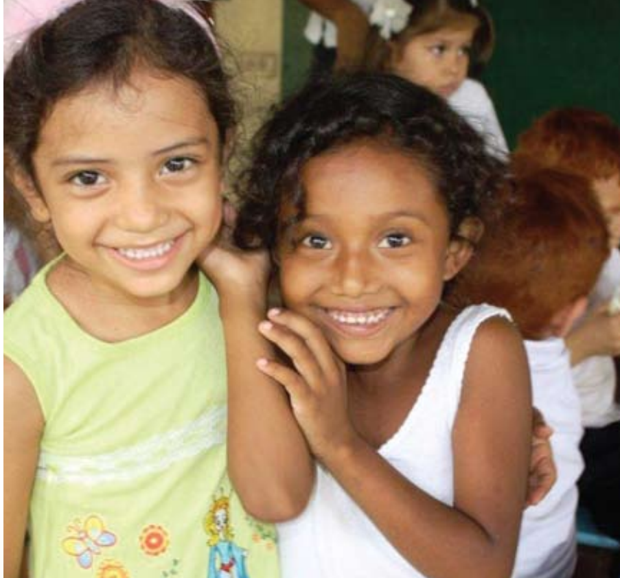
These two little Nicaraguan girls light up the world with their smiles.

In Wichita, Kansas, a group of 12 students and two adult chaperones from St. Joseph's Academy learned more about the Sisters of the Congregation of St. Joseph and their love of the dear neighbor when they helped renovate a house for the StepStone Transitional Housing Program. This program provides housing to women and children who are escaping a violent situation. The students painted, cleaned up