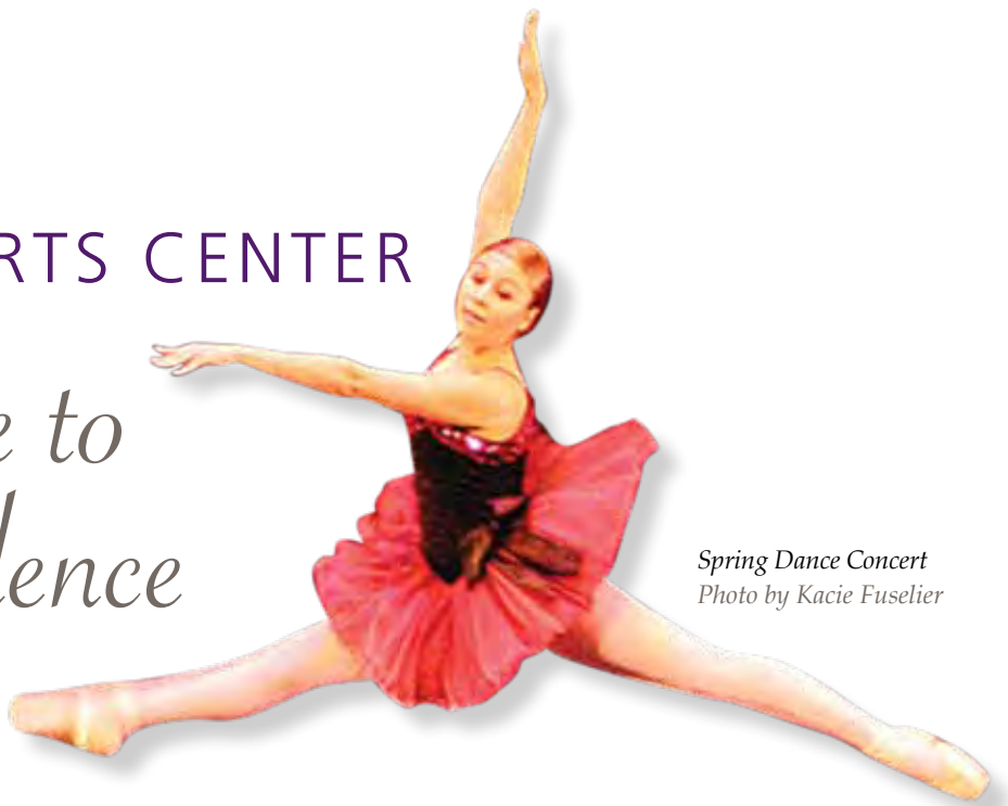
Spring Dance Concert

How exciting! St. Joseph's Academy in Baton Rouge, La., will have its brand new Academy Arts Center completed in July and ready for the fall semester of 2012. But instead of thinking of opening nights and glamour, think about students developing their talents and abilities, not only for their own enjoyment, but in service to others, as well.