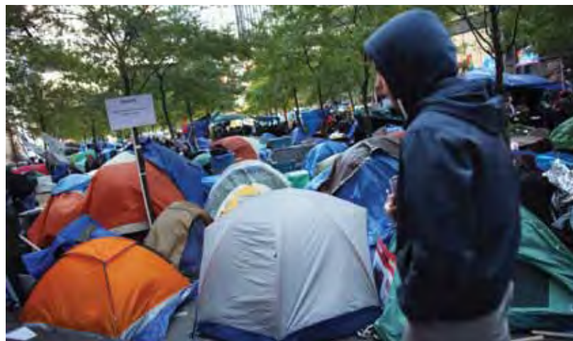
Occupiers in New York City.