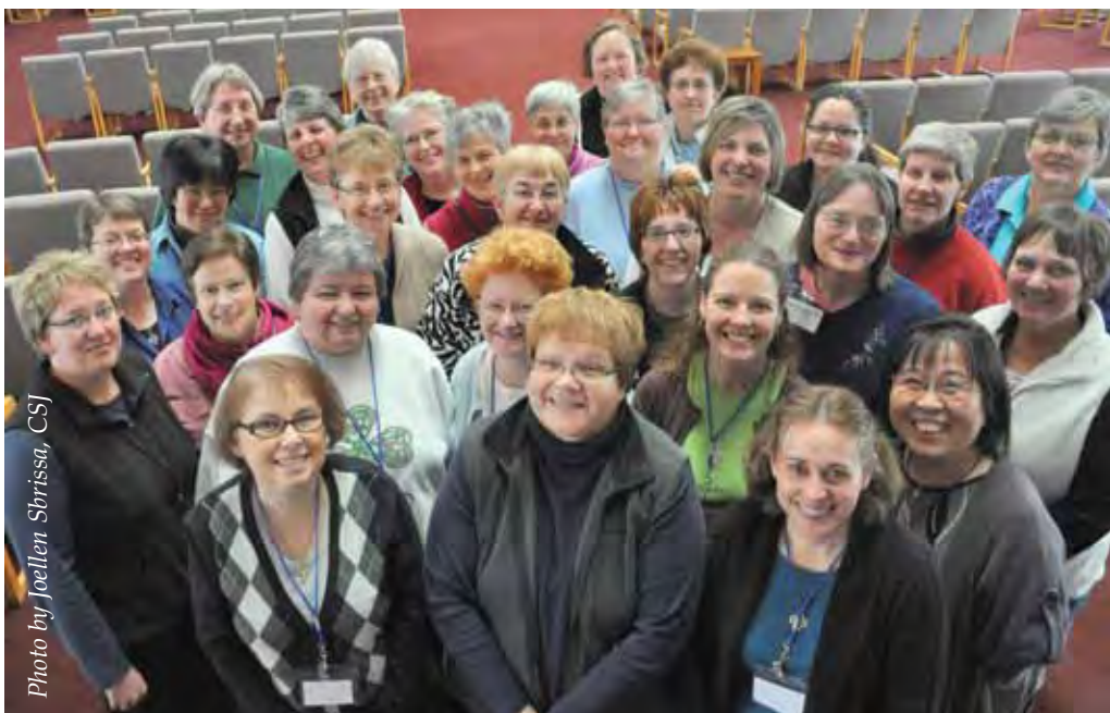
These sisters are just some of our members who are participating in leadership development that will encourage all people to contribute their skills and gifts, always for the common good.

As a result, Dear Neighbor Ministries initiated a training program called “Getting Ahead in a Just-Getting-By World,” for eight of its clients living on limited resources.