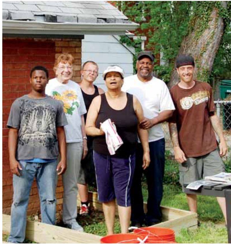
The 500 Gardens project brought neighbors together like never before for common purposes: beautifying the neighborhood, enjoying home-grown vegetables and sharing with people in need in the area.

The Director of the Lighthouse Community School changed the troubled students who hung out in the parking lot trying to sneak a smoke into a cohesive team with a growing interest in raised beds for gardening. Their fresh food helped feed their neighbors. The task even became a job opportunity for some of the students. The school has expanded to an