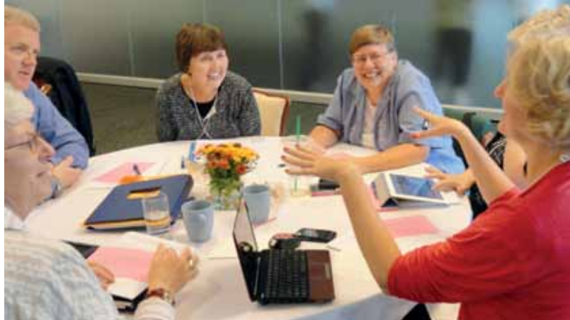
Part of our congregation's efforts to build relationships and support our dear neighbors involve collaborative meetings that bring together our ministry leaders, sisters, ministry board members and staff. This picture was taken at a recent CSJ Ministries convocation.

We are now in a period of research and conversation with multiple nonprofit groups, considering special needs populations, sustainable farming, renewable energy, and expanded ways to share spiritual nourishment with our dear neighbors . We are working with the consulting firm of Hofmann, from Appleton, Wisconsin, to creatively design living spaces for ourselves and future generations, based on their