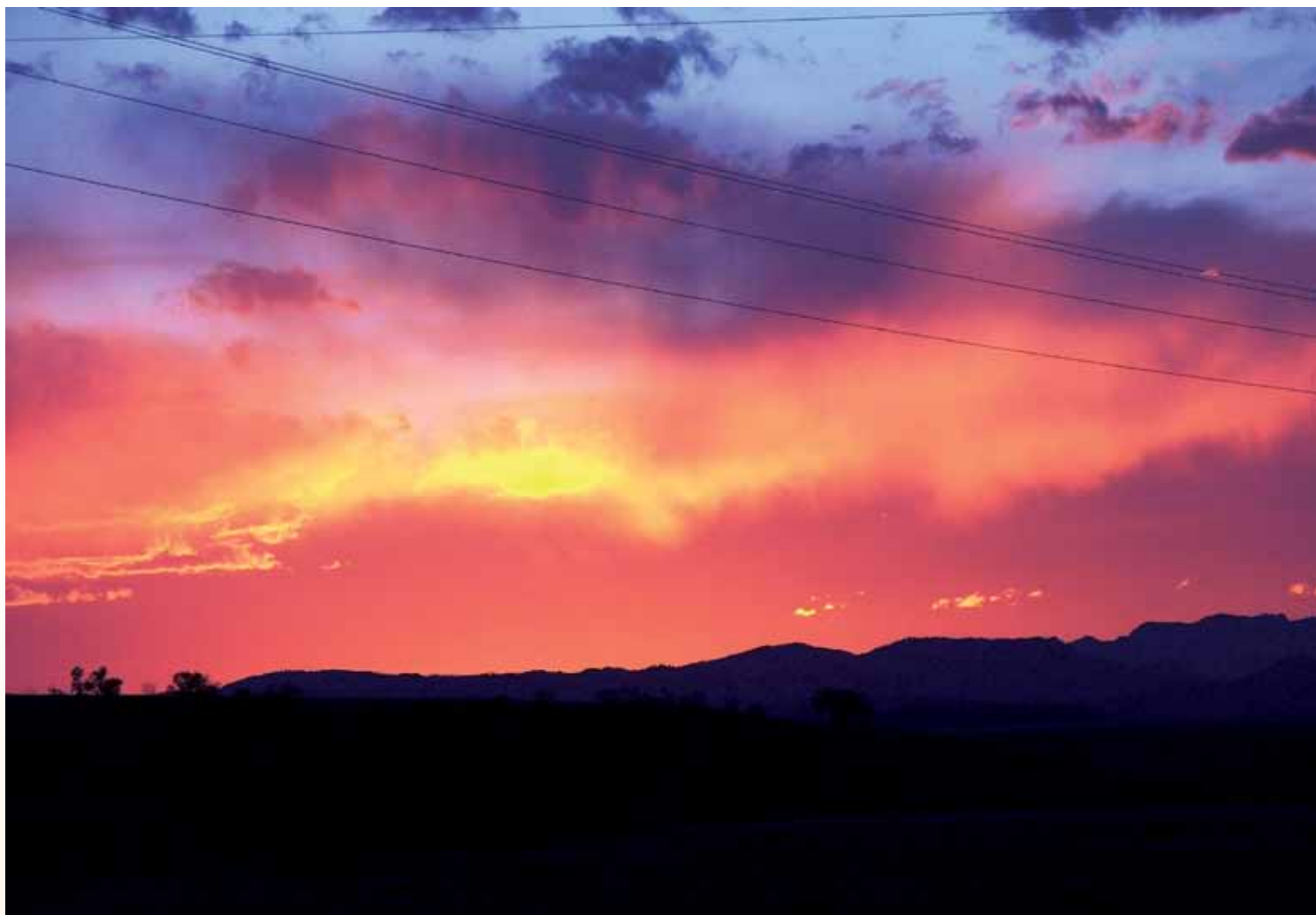
Sunset on the way from the Badlands to Rapid City, South Dakota