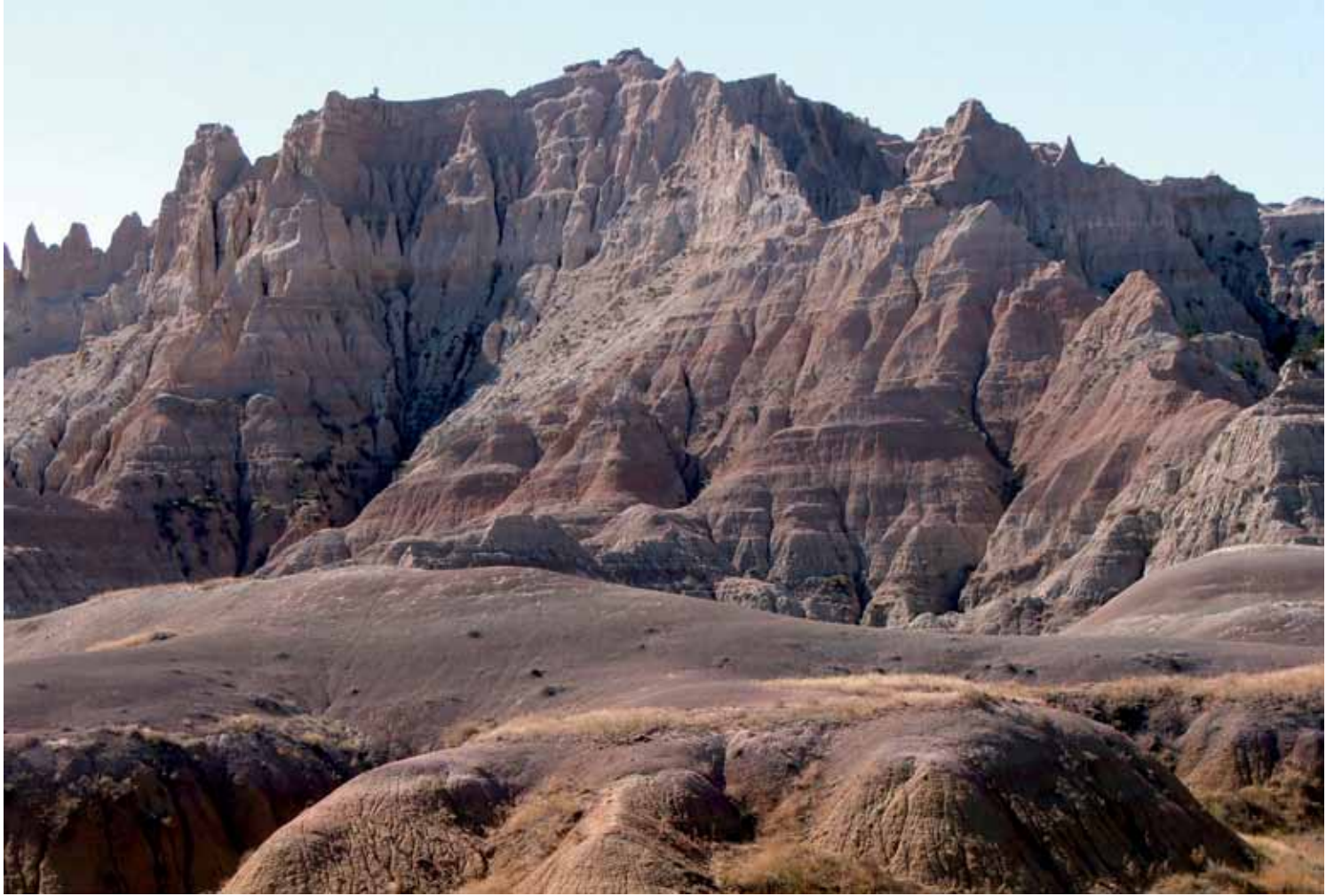
The barrenness of the Badlands presents no mystery about how these rock formations came to be named.

of the people of this state? I can only imagine what it was for the first settlers to have painfully made the trip across the plains and to arrive at the edge of what is in many ways a wasteland. And wasteland that it appears to be, it has its own incredible majesty and beauty — layer upon layer of limestone, golden, rose, blue and every hue between that shifts in the changing day as the clouds roll across the sky. I have stopped in wonder on an evening, when the sky was mauve, and a silver disk of moon rose over the rock formations. God spoke; God called; God smiled in the mystical moment.