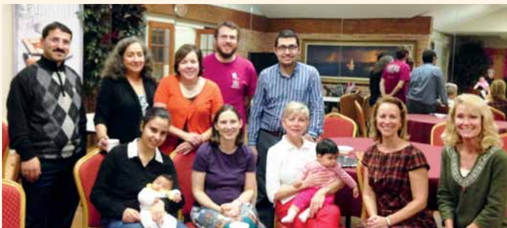
These program participants at St. Joseph Spirituality Center in Baton Rouge, Louisiana, were interested in integrating spirituality with social justice work.