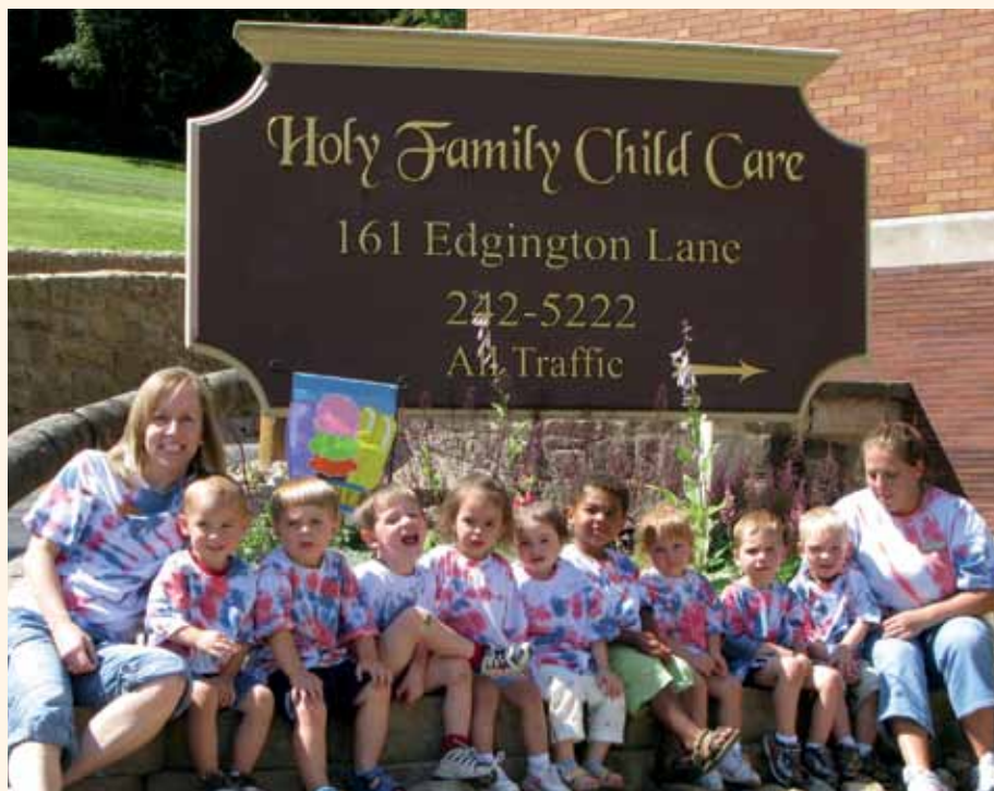
Holy Family Child Care and Development Center today has 75 children enrolled.

staff of 20 provides high-quality, developmentally appropriate early care and education Monday-Friday, 6:00 a.m.-6:00 p.m., 52 weeks per year. In collaboration with the Ohio County Public Schools, the center offers a Universal Pre-K program for 4 year-olds, as well, and can provide occupational, speech and physical therapy for those children who need it.