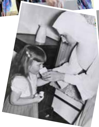
> A sister cares for a child at St. Joseph Hospital in Park Rapids, MN.