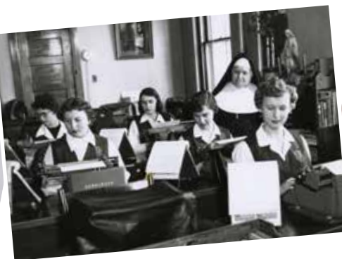
Typing class at St. Joseph's Academy in Crookston.