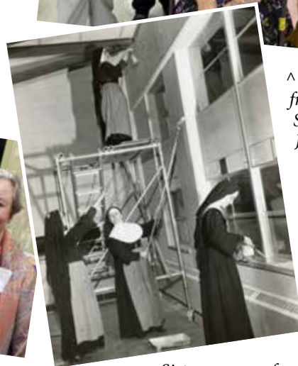
Sisters prepare for the first day of school with a fresh coat of paint. McNicholas High School, 1951.