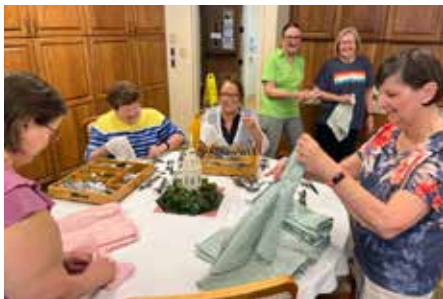
Associates help prepare for the 2023 Jubilee celebration at Mount St. Mary.

If you prefer to receive this newsletter electronically, please email communications@csjoseph.org .