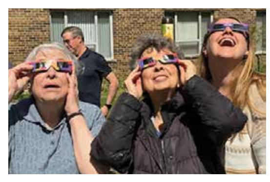
On April 8th, sisters, associates, staff, and friends gathered in the courtyard of our La Grange Park center to watch the solar eclipse.

If you prefer to receive this newsletter electronically, please email communications@csjoseph.org .