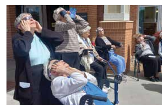
On April 8th, sisters, associates, staff, and friends gathered at our Wichita center to watch the solar eclipse.

If you prefer to receive this newsletter electronically, please email communications@csjoseph.org .