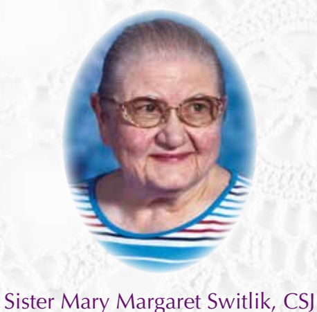
Entered into eternal life on October 4, 2023, after 68 years of religious life.