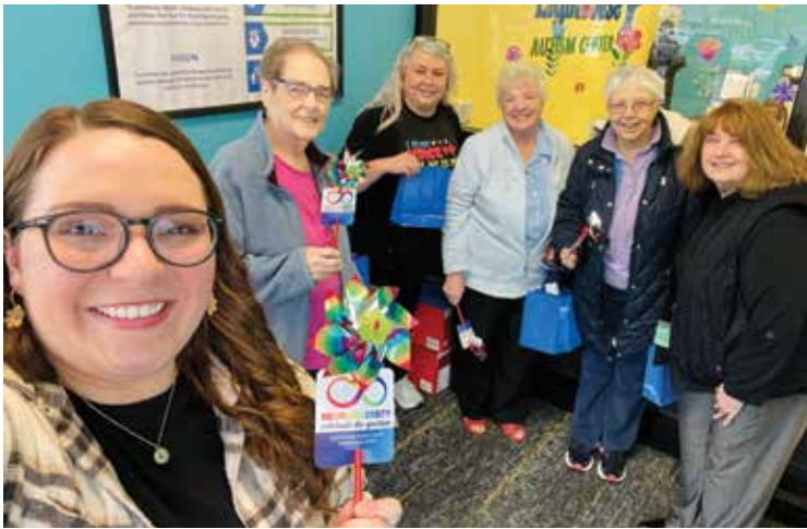
On April 2, sisters and staff gifted goodie bags to Lighthouse Autism Center in Kalamazoo in recognition of World Autism Awareness Day.