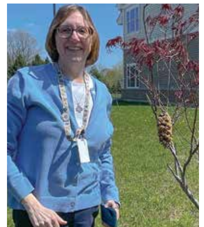
As part of their observance of Earth Day this year, sisters and lay residents gathered to create natural birdfeeders which were made by covering pinecones with peanut butter and seeds. Afterward, the feeders were hung on trees around the Nazareth campus for all our winged and furry friends to enjoy!