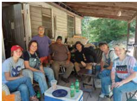
<Volunteers visit with a homeowner after repairing an unsafe floor.

While this crucial and life changing work is being done, relationships with these neighbors are being established, drawing the community closer. The congregation is proud to partner with Bethlehem Farm, which embodies our mission of unity and service to the dear neighbor . ●