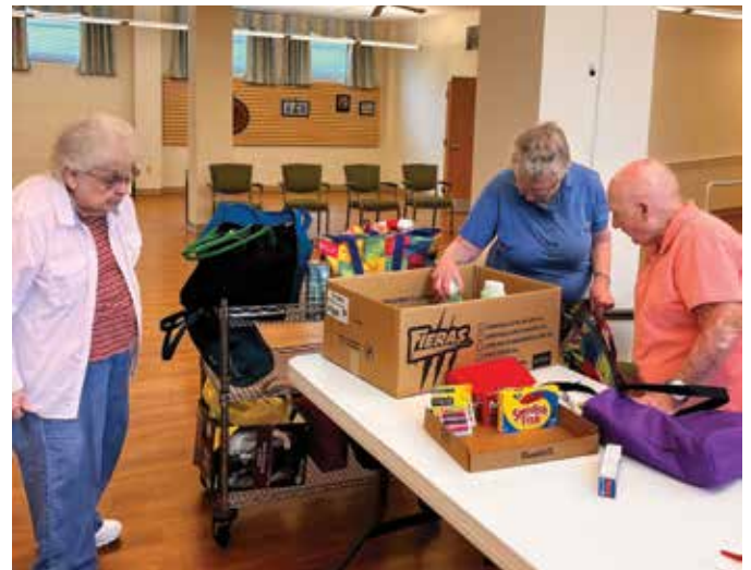
Sisters gathered to put together reusable tote bags in preparation for the Healing, Health and Hope Earth Festival (left). The bags included an ecological education insert, pollinator seed packets, and free samples of Tru-Earth laundry strips, and were given out at the festival. Sisters also packed totes with toiletries for the women at the YWCA WIND (Women Inspired in New Directions) program (right).