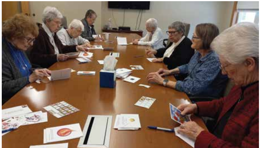
In April, sisters gathered to write notes of appreciation inside thank you cards that were then given to employees on May 1st, St. Joseph the Worker Day.