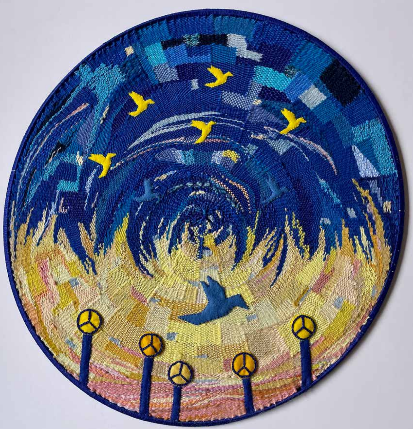
Aerial Ballet of Peace Cranes by Sandy Bot-Miller