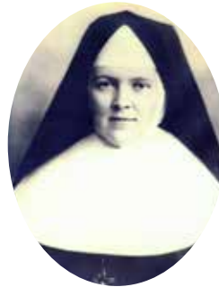
< Mother Stanislaus Leary who founded the Sisters of St. Joseph in La Grange Park in 1899.