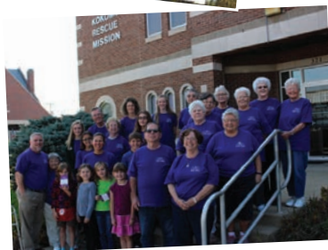
^ Sisters, associates, and other partners in mission volunteer at Kokomo Rescue Mission during the congregation's annual Service Days in 2016.