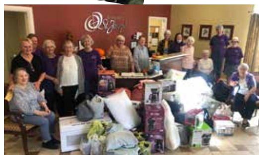
< Sisters and associates collected items needed by those affected by hurricanes in 2021.