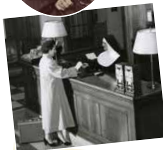
< A sister at the front desk of The Fontbonne in Cincinnati.