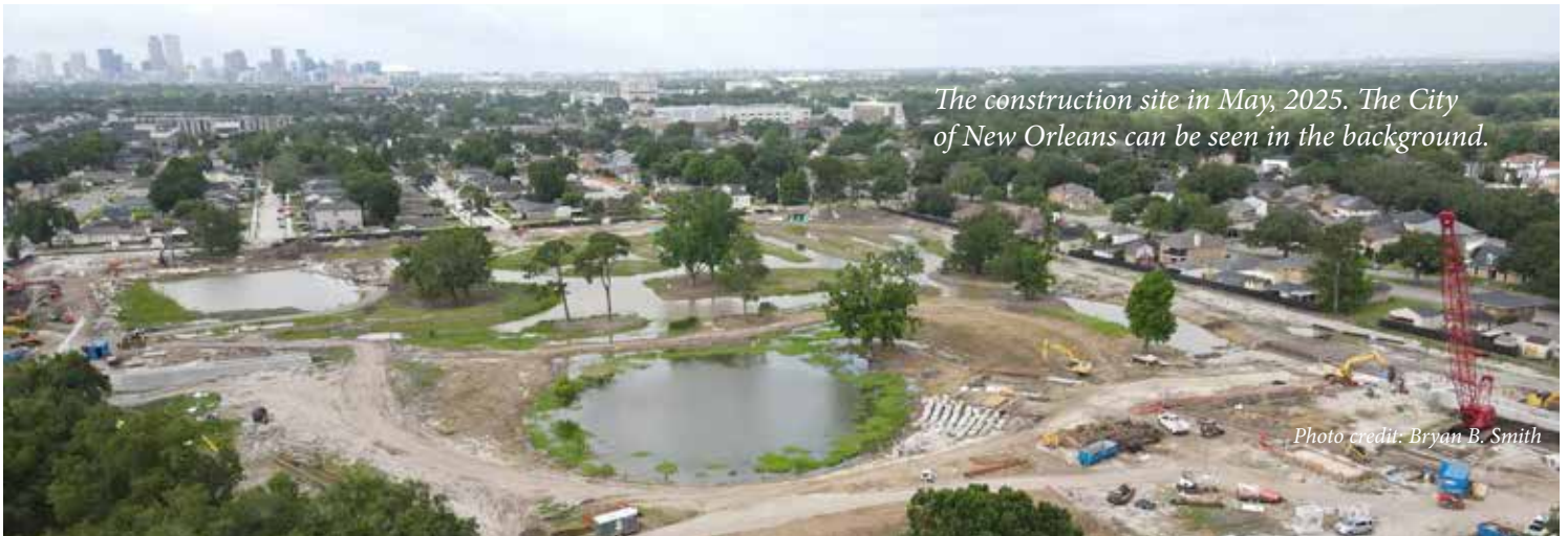
The construction site in May, 2025. The City of New Orleans can be seen in the background.