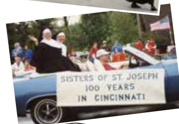
< Sisters celebrate their 100th anniversary in Cincinnati in 1993.