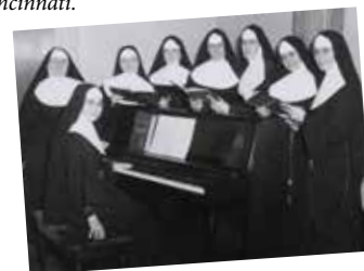
^ Sisters at St. Joan of Arc in Minneapolis.