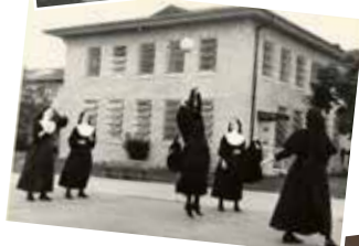
< Sisters play basketball at the Provincial House on Mirabeau Ave. in New Orleans in 1958.