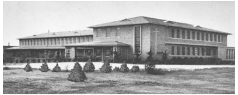
Sisters of St. Joseph Provincial House and Novitiate in 1955.

Once operational, the Mirabeau Water Garden will help mitigate flooding and potential loss of property for the people and City of New Orleans. Developing this sacred land for use in this way bears witness to our mission and to our commitment to care for God's creation and one another without distinction. ●