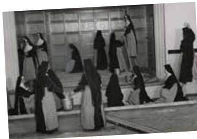
^ Sisters at St. John Hospital in Kalamazoo preparing for dedication day in 1952.