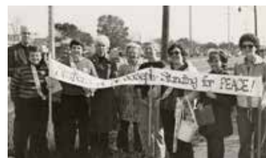
^ Sisters and friends attend a nuclear protest in 1984.