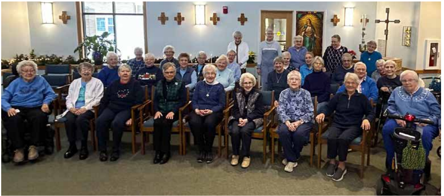
January is Human Trafficking Awareness and Prevention Month, and on January 11th, sisters in Nazareth wore blue in support for and recognition of Human Trafficking Awareness Day.