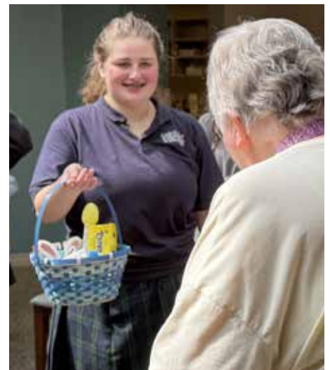
In April, students from Saint Joseph Academy visited St. Joseph Center and brought our sisters Easter baskets they put together themselves. Thank you to all who helped make this a special Easter for our sisters!