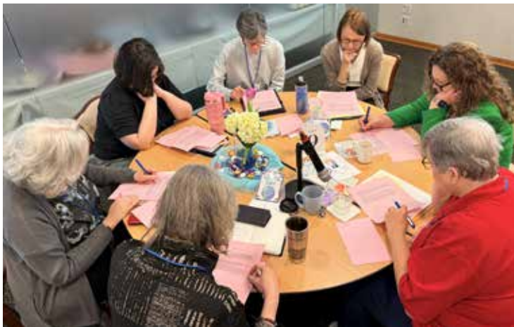
Bottom: Sisters, associates, and staff at one table during small group discussion.