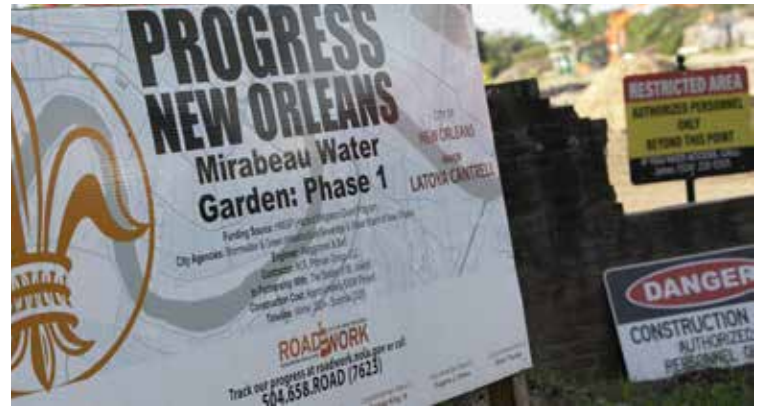
Phase one of the water garden project is expected to be completed in early Fall.

Phase two of the project which includes a dedication to the sisters will follow in the years to come. We are so proud to be part of this innovative, inspiring, and much needed project! ●