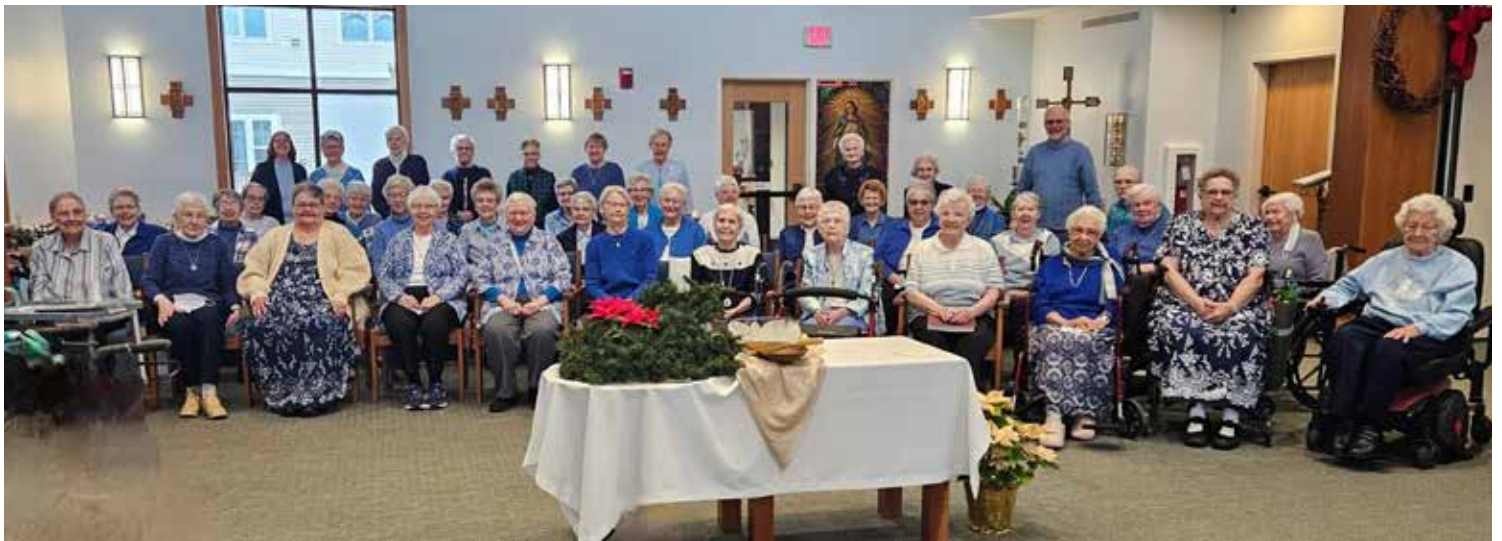
January is Human Trafficking Awareness and Prevention Month, and once again, sisters in Nazareth wore blue in support for and recognition of Human Trafficking Awareness Day.